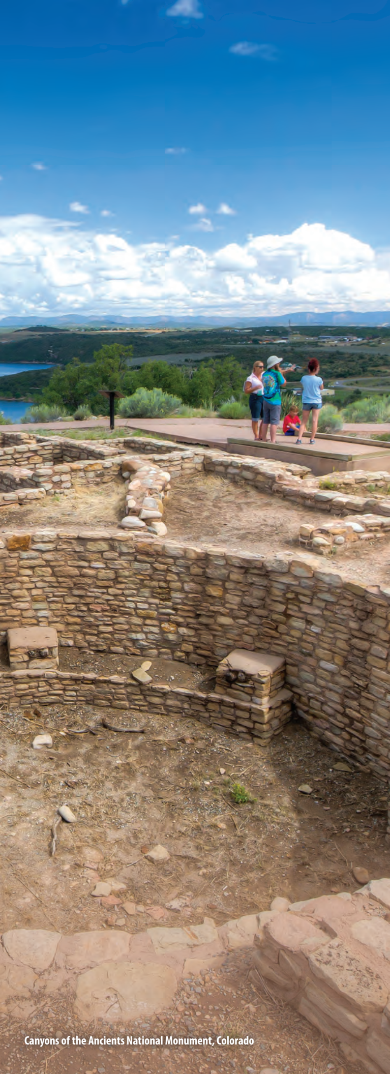
Canyons of the Ancients National Monument, Colorado